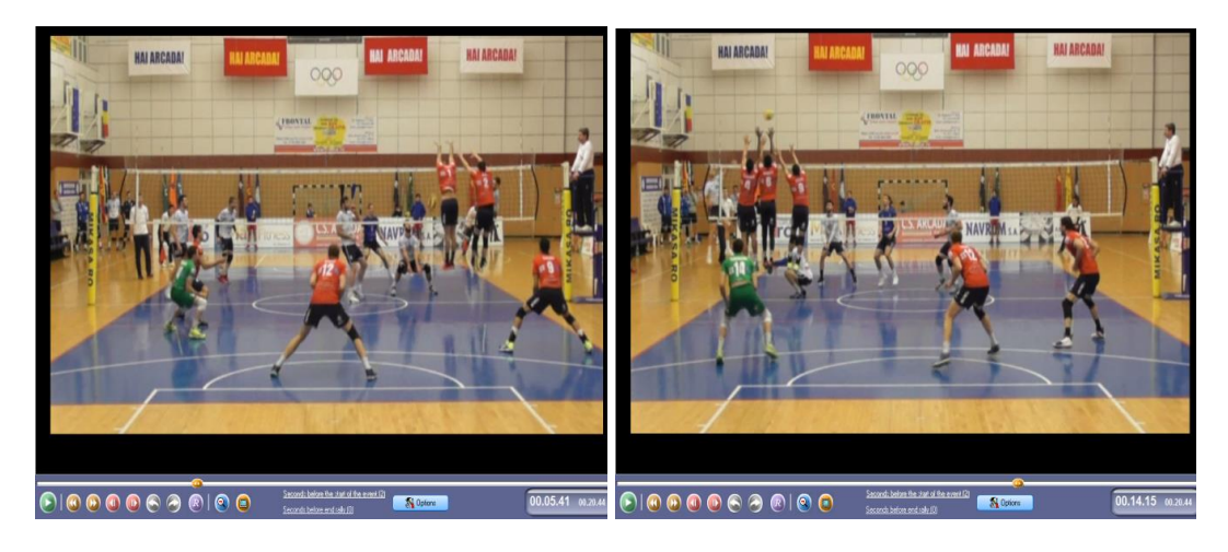
Figure 2 . Images taken from the montage offered by the "Data Video" system

Here, we watched first of all the moving speed in blocking towards the 4<sup>th</sup> zone and towards the 2<sup>nd</sup> zone or the 1<sup>st</sup> zone, the reaction time when the opponent played the first round, but also the arms technique during the execution of this technical element (Fig. 2).