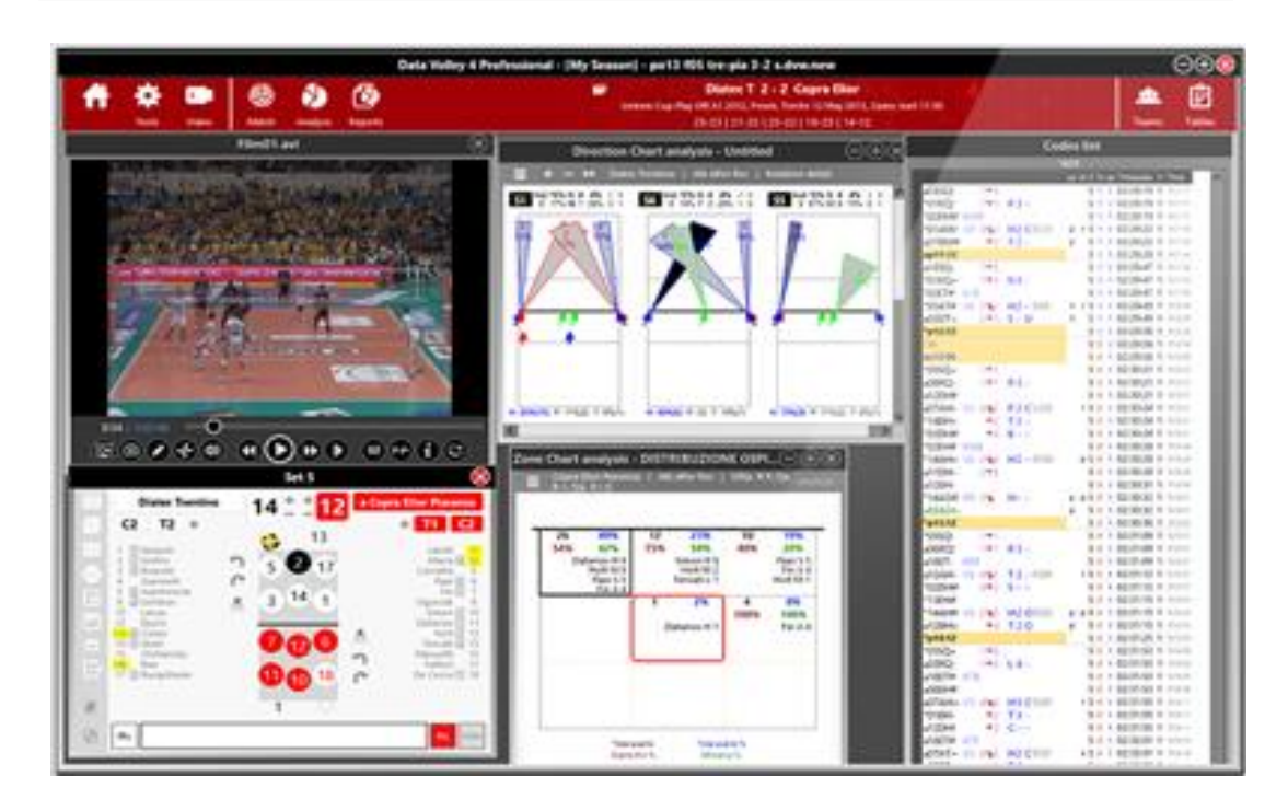
Figure 1. Statistical analysis during an official game with the "Data Volley" software

In the volleyball game, there are five game positions, named accordingly: the Setter, the Right-side hitter, the Opposite, the Middle Blocker and the Libero.