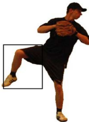
Figure 2. Photo number 3 in the ETD which shows the movement error „supporting leg is elevated“.

An example of movement errors presented in EDT is shown in Fig. 2.